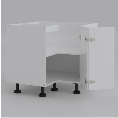
FKC900BCRN : 900mm x 580mm x 730mm