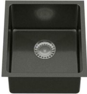
TECH60U: 330mm x 370mm x 180mm